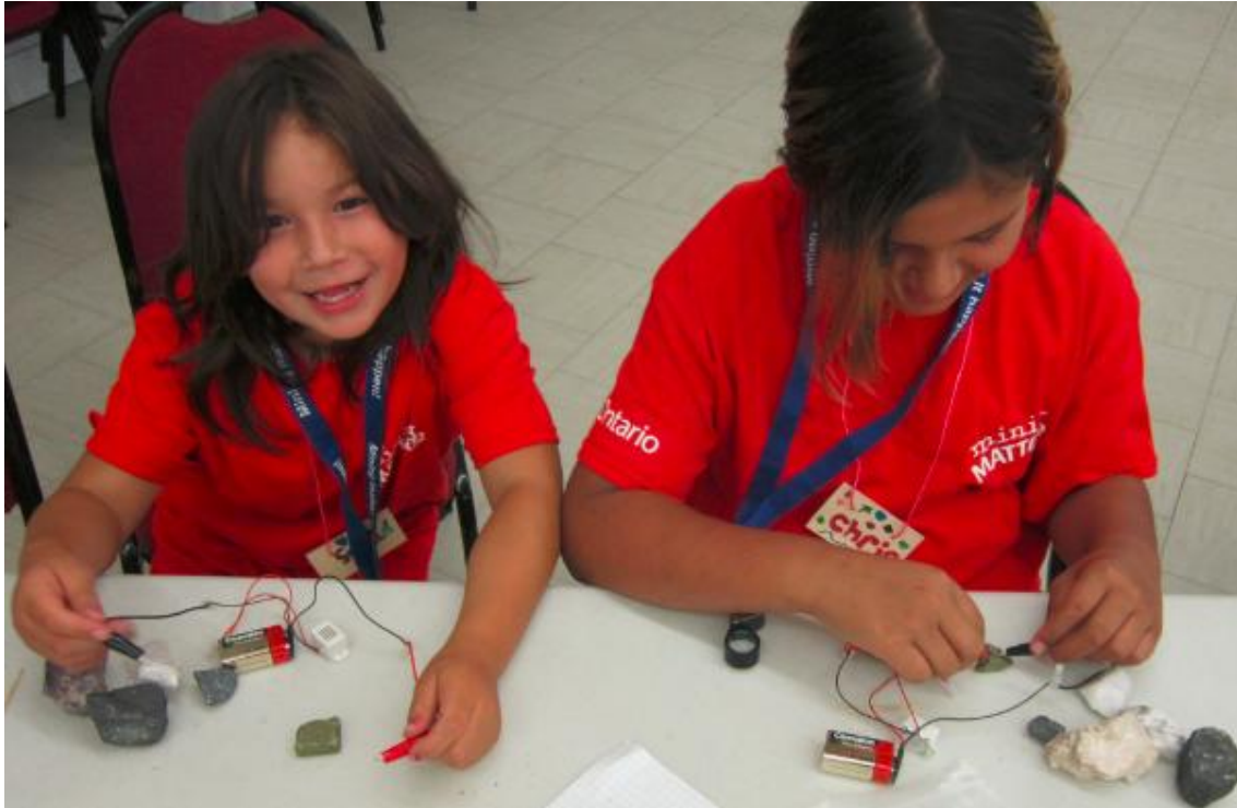
Students testing minerals, Constance Lake, ON, July 2015

In Northern Ontario, a mineral resource-rich area known as the Ring of Fire, covering approximately 5,120 km 2 , promises significant mineral development opportunities, including production of chromite, nickel, copper and platinum. Ontario's Ministry of Northern Development and Mines (MNDM) works with government, industry and Aboriginal peoples to encourage responsible, sustainable economic development in the region.