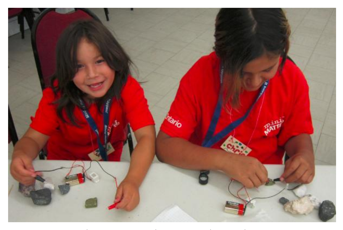
Students testing minerals, Constance Lake, ON, July 2015

In Northern Ontario, a mineral resource-rich area known as the Ring of Fire, covering approximately 5,120 km², promises significant mineral development opportunities, including production of chromite, nickel, copper and platinum. Ontario's Ministry of Northern Development and Mines (MNDM) works with government, industry and Aboriginal peoples to encourage responsible, sustainable economic development in the region.