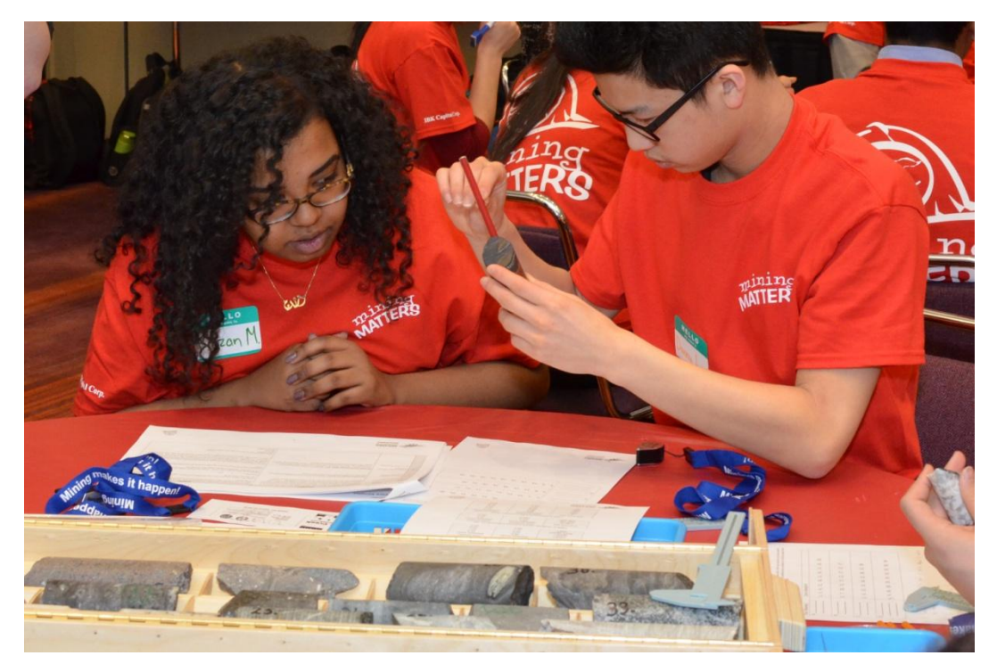
Secondary Students testing core samples for magnetism, PDAC Convention, Toronto, ON, March 2016

Mining Matters hosted a three-day education program for teachers, junior students and high school students during the PDAC convention. On Sunday, 32 teachers and pre-service teachers attended the Teacher Day programming, followed by 73 students and 10 adults on Junior Day and a further 78 students and 4 adults on High School Day.